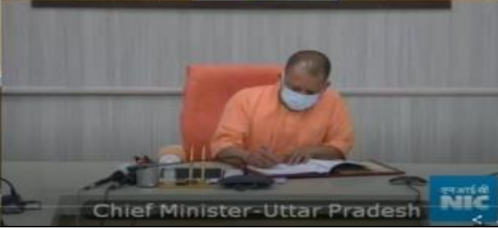
Signing of Tripartite Memorandum of Agreement for implementation of Ken-Betwa Link Project