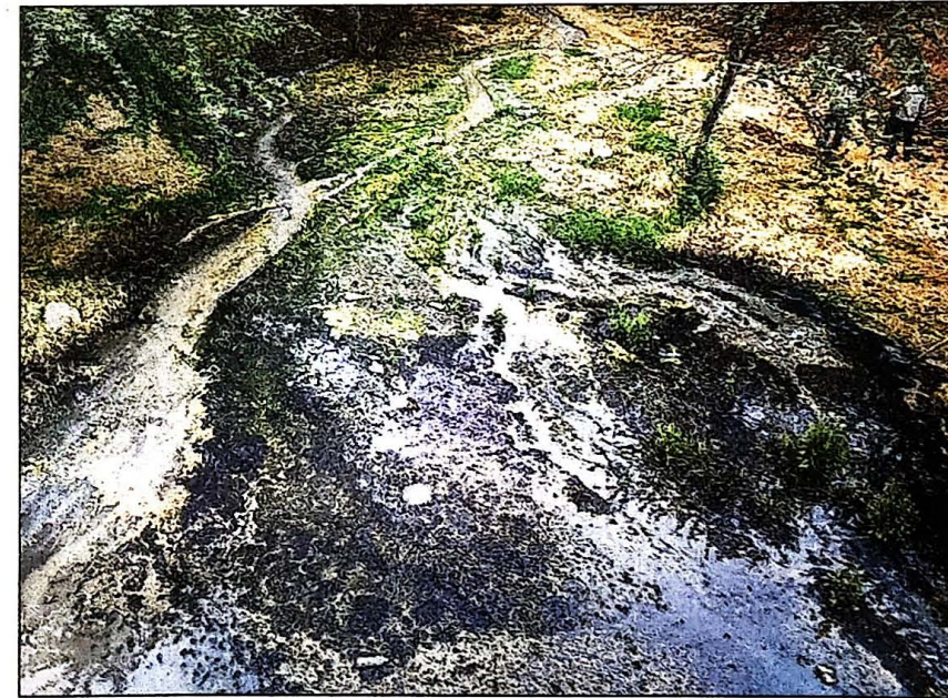
GOING DOWN THE DRAIN: The lake is among 1,040 waterbodies listed by Delhi govt's wetland authority for notification and preservation in 2021